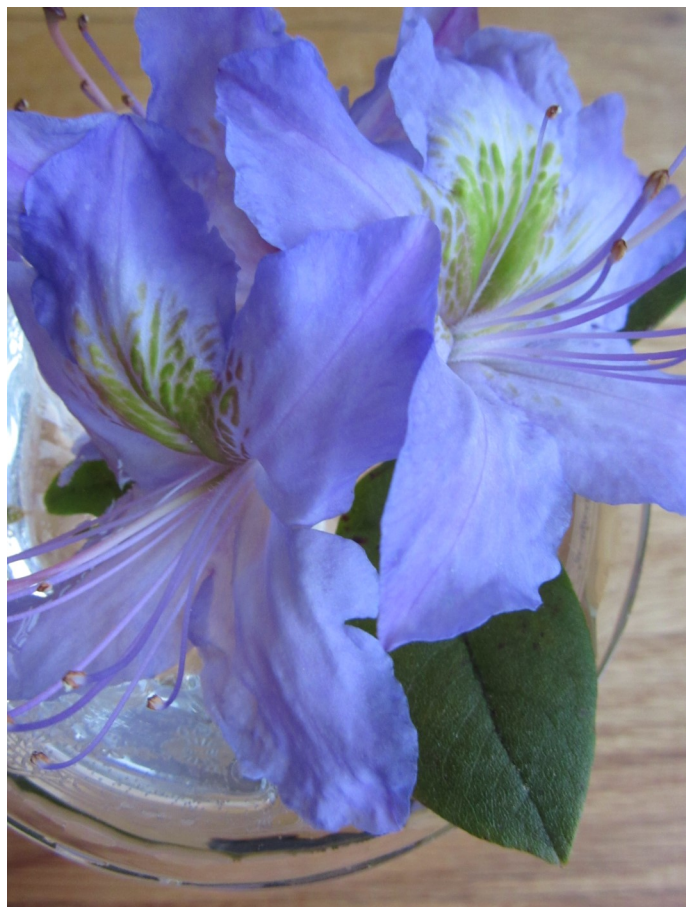
Below: Rhododendron augustini "Green Eye"